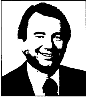
Tommy G. Thompson Governor

"Housing is one of the most important issues facing Wisconsin as we head into the 1990s. In the years ahead, the State will broaden its role in housing. We will look for ways to help first time homebuyers buy into the American Dream, and we will provide greater support for multifamily housing development. I look to WHEDA to provide leadership and financial support as we work to ensure that every person in Wisconsin has a decent place to live. The Authority has the unique ability to leverage financial resources, maximizing the benefit to Wisconsin citizens."